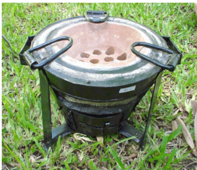
Figure 2: Sazawa Charcoal Stove